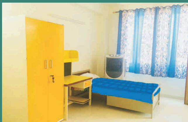
Guest Room for Parents